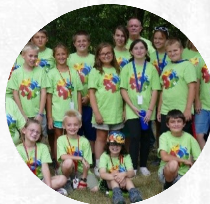
Doug Cook Memorial Fund